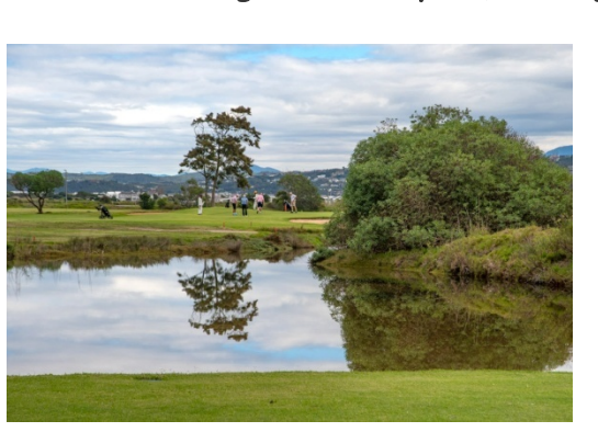
Great golf course