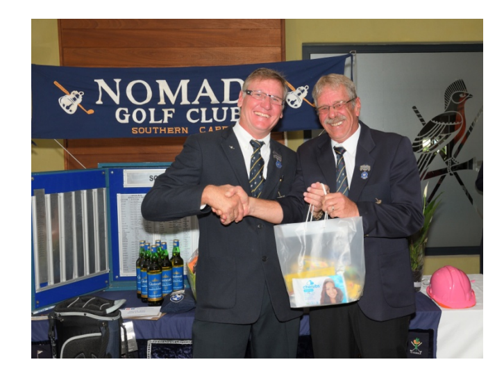
Les Marais receiving the 'matchbox'