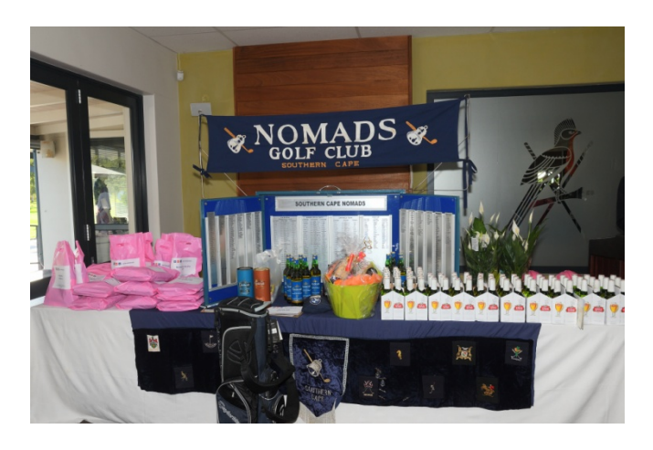
A very nice prize table from PCL Auto Services

We had a field of 60 players made up of 54 Southern Cape Nomads, 2 visiting Nomads, 1 guest and 3 prospective Nomads.