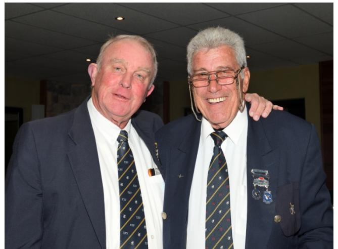
Two smart gentlemen