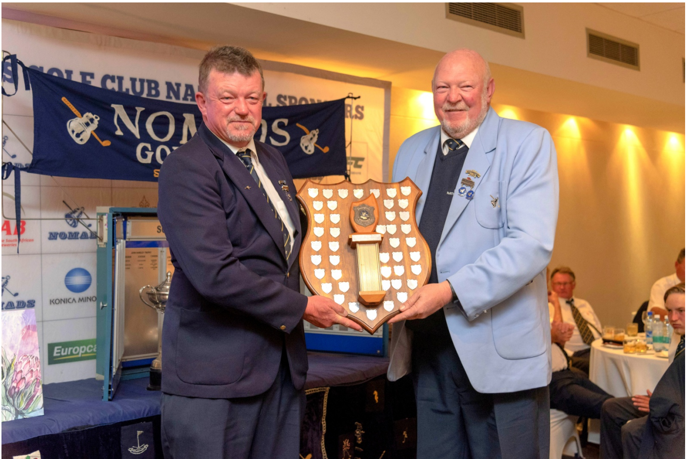
A popular win for Southern Cape.....!!!