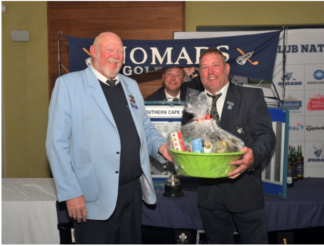
Who won 'Mikes' hamper?