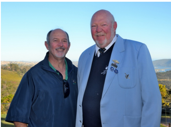
The Bezuidenhout brothers.