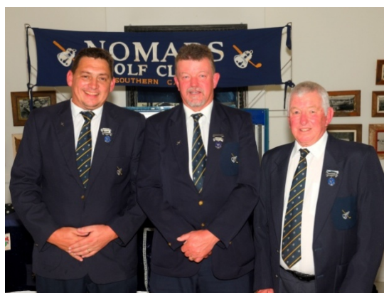
The "A team"