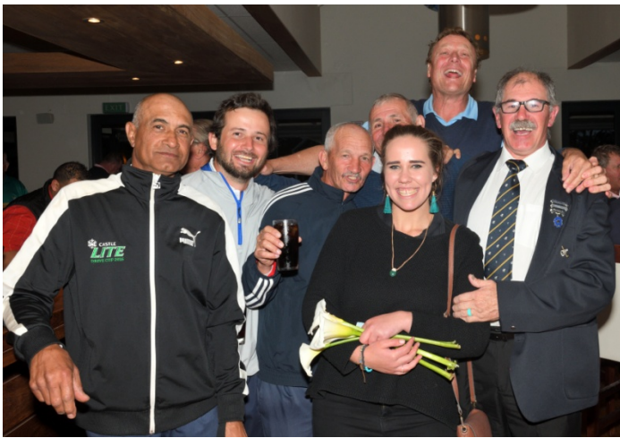
Entertaining the young lady...!!