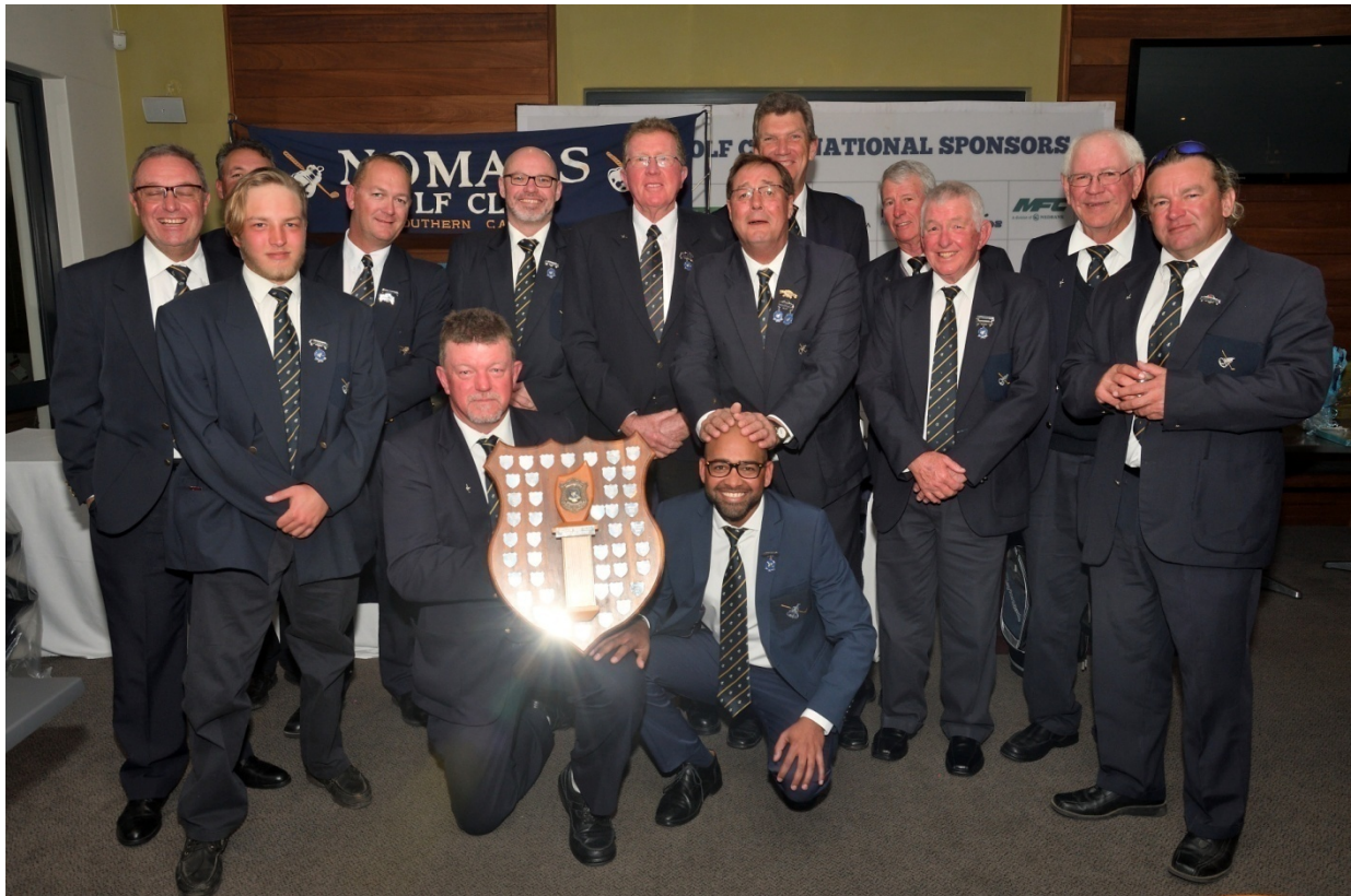
The winning team displaying the Seaboard Trophy