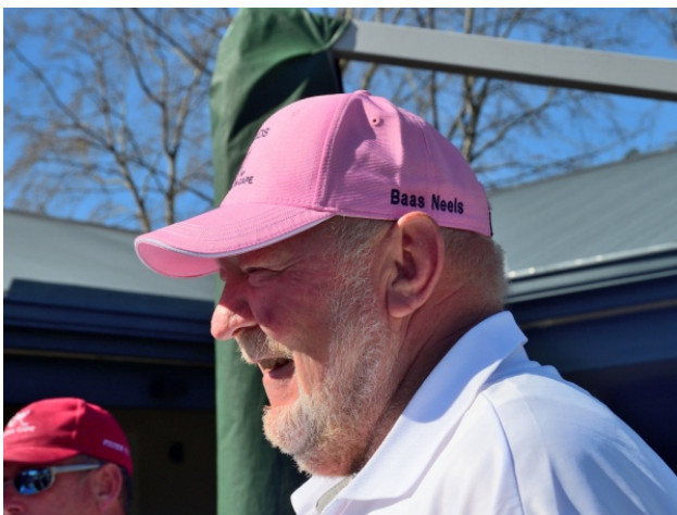
An honorary member of Southern Cape