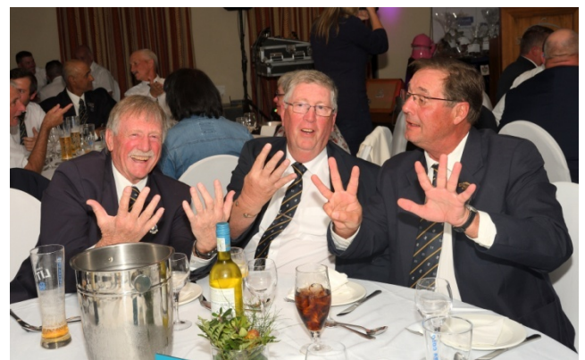
These guys can't count....!!!