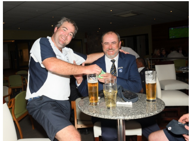
K... en betaal.