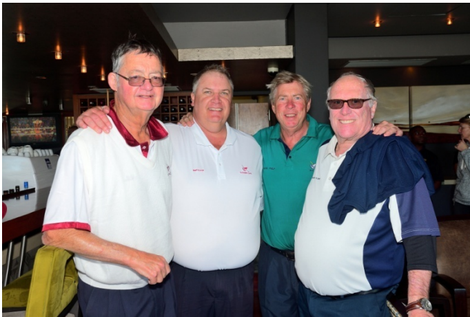
Some past National Chairmen.