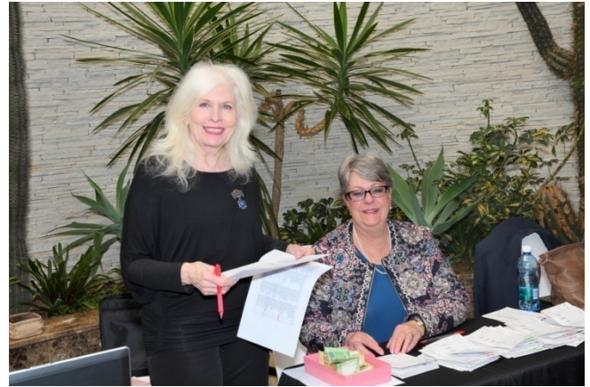
The lovely ladies were on duty, as usual