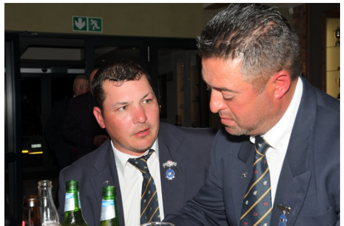
"You can't fine the National Chairman"