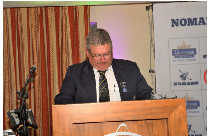
Great fines session