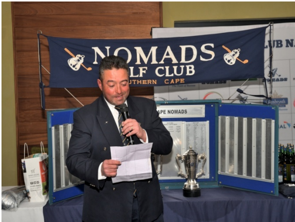
He was in 'fine' form...!!