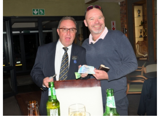
Money changing hands...!!