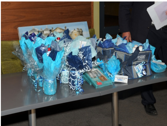
A very nice prize table from MPK