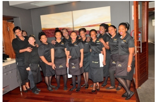
The Simola staff were very helpful