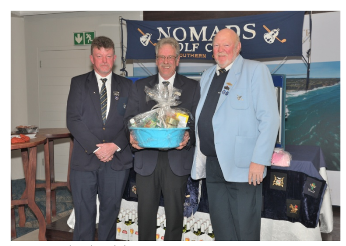
Les won 'Mikes' hamper