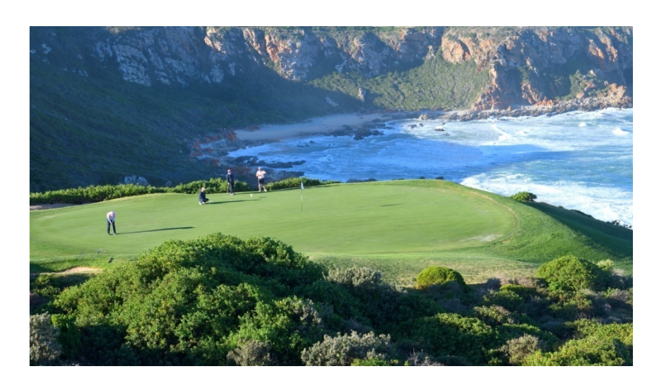
The beautiful Pinnacle Point course.