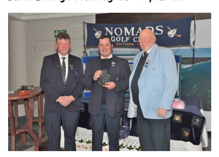
MAD JLF CLUB JUTHERN CAPE