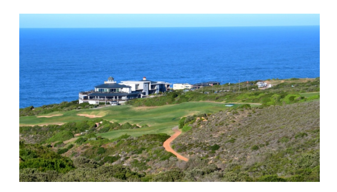
Aren't we fortunate being able to play on such great courses?