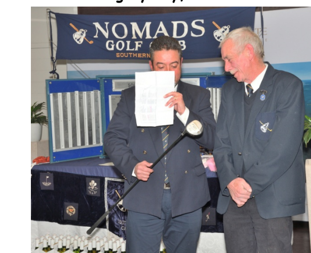
Who's a naughty boy, then?