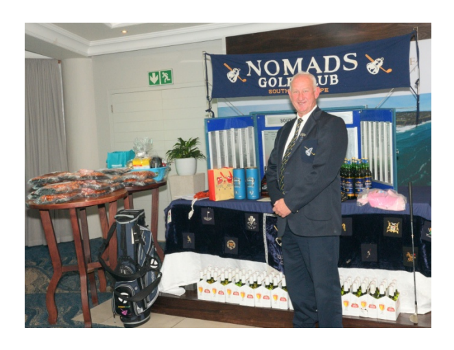
Thanks to our sponsor of the day: