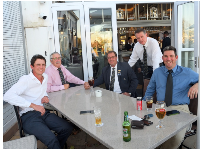
Flats holding court