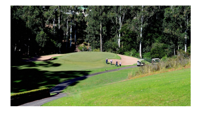
Aren't we fortunate being able to play on such great courses?