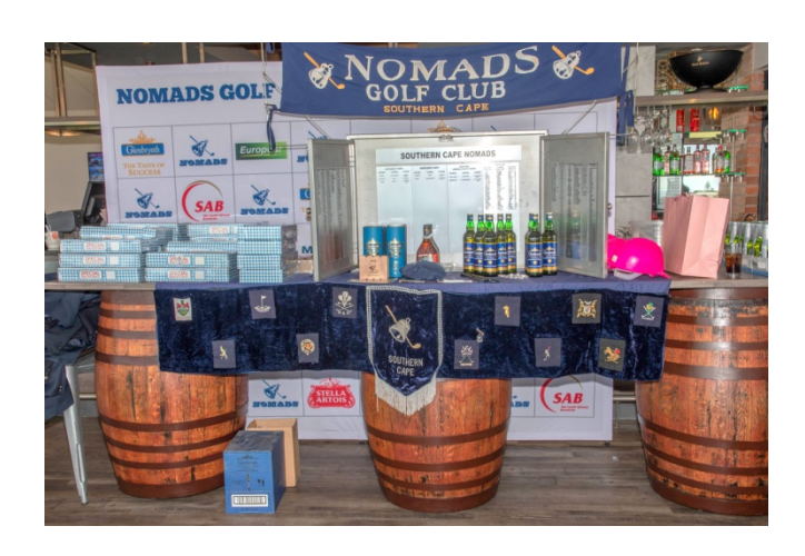
Great prize table from sponsor of the day Coastal Companies, fellow Nomad, Christo Langenhoven