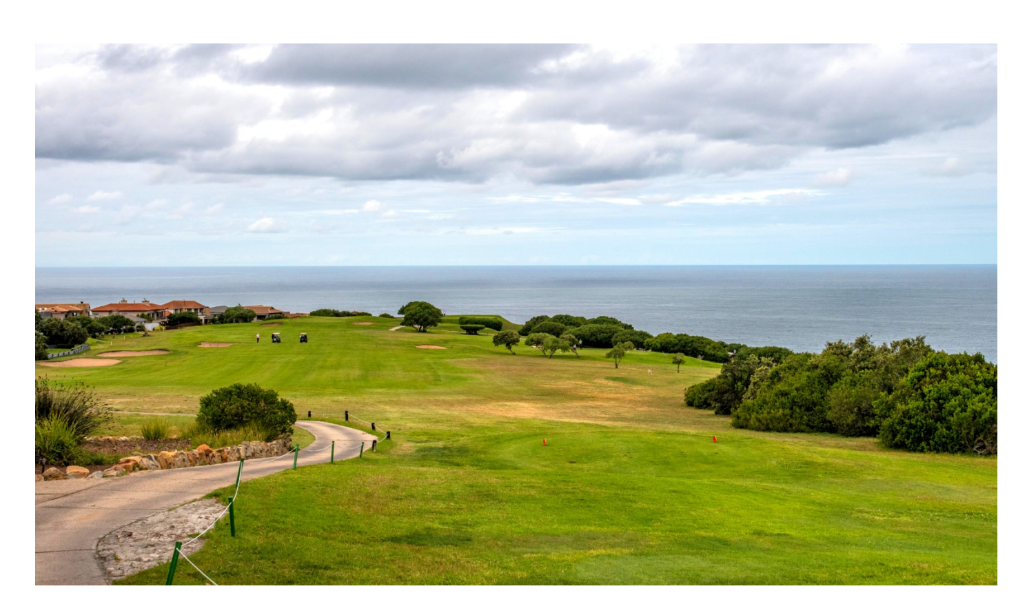
The beautiful Mossel Bay course.