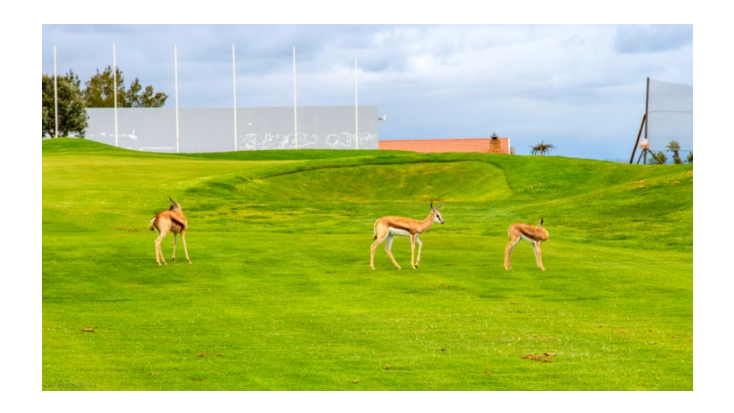
Aren't we fortunate being able to play on such great courses?