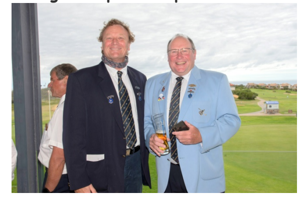
Catching up with the National Chairman