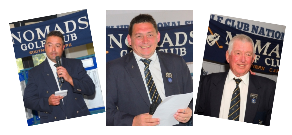
The "A team"