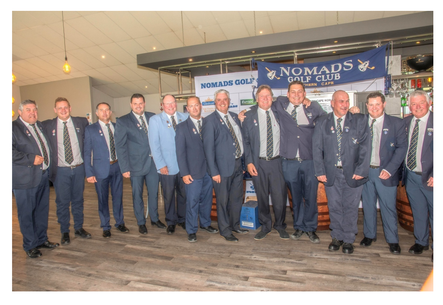
Bert Hunt trophy winners, 2021