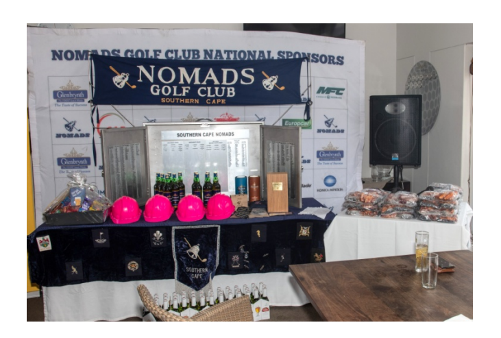
A very nice prize table from FMZ Cellular