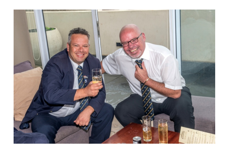
Everyone is smiling, despite the rain