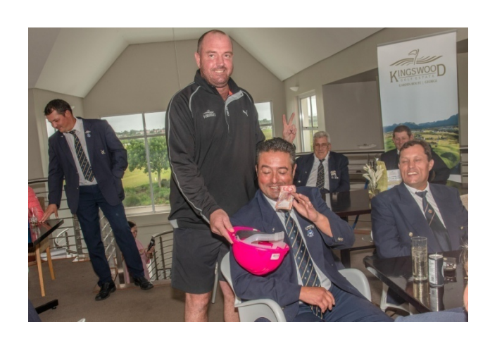
...first fine: Tjoepie....!!!!