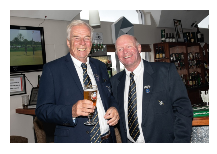
Two smart Nomads....!!