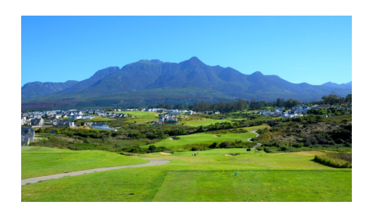
The beautiful Kingswood course.

Kingswood Game – 19<sup>th</sup> January 2020