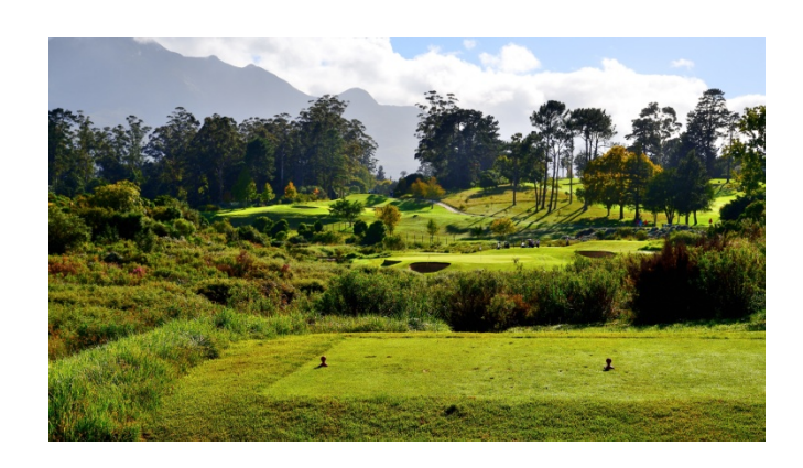
Aren't we fortunate being able to play on such great courses?