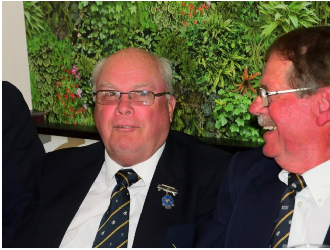
Will is back.....