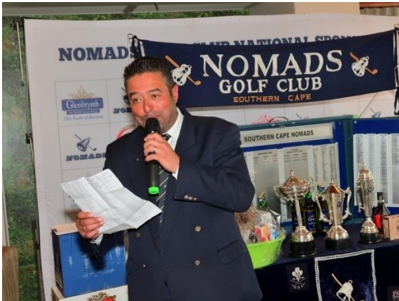
He's back, with a vengeance