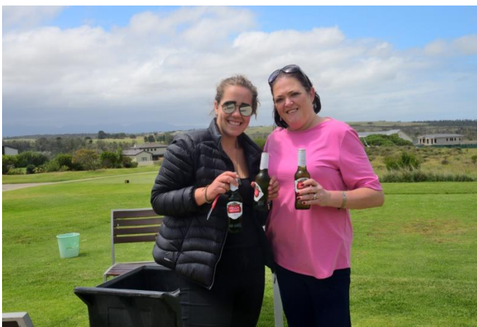
Replenishments on the course...!!