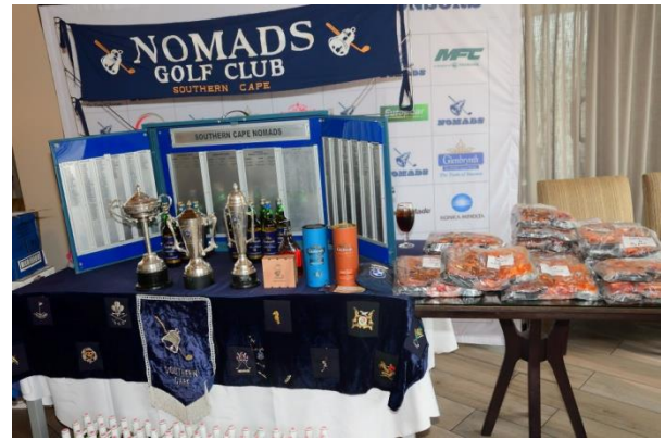
A very nice prize table from Batefin Auto.