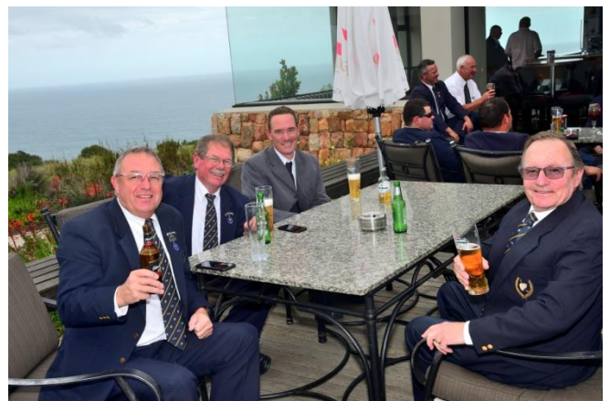
Nice on the veranda