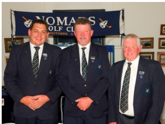
The "A team"